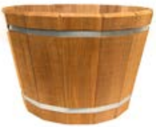
CEDAR TUB L MODEL # G3010 UPC # 098568101017 DIMENSION: 22"X16" PACK SIZE: 32