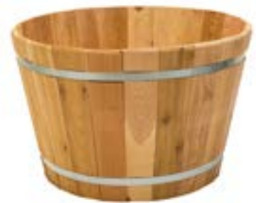
CEDAR TUB XL MODEL # G3002 UPC # 098568852117 DIMENSION: 24"X16" PACK SIZE: 24