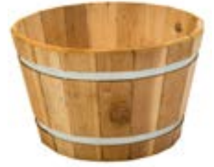
CEDAR TUB M MODEL # G3020 UPC # 098568101604 DIMENSION: 20"X12" PACK SIZE: 30