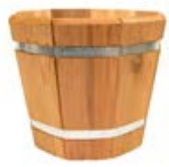
CEDAR TUB S MODEL # G3030 UPC # 098568101109 DIMENSION: 15"X12" PACK SIZE: 36