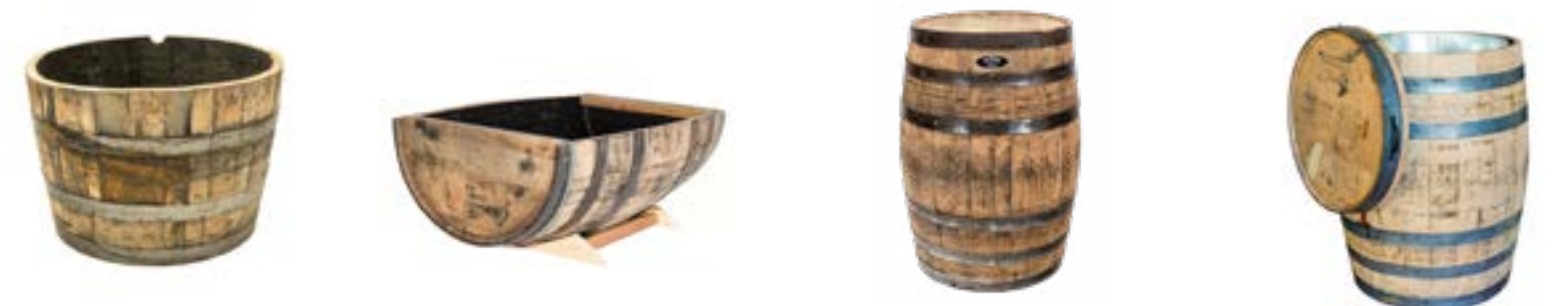
HALF BARREL MODEL # B100 UPC # 098568991007 DIMENSION: 26"X17.5" PACK SIZE: 18